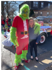
A few pictures from our Grinch Parade 2021