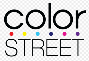
Color Street Nails by Amy