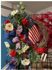
Wreaths by Twisted Vines Gail

Still room for plenty more. Call the office to reserve your spot!